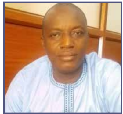
Musa Akebe Photographer